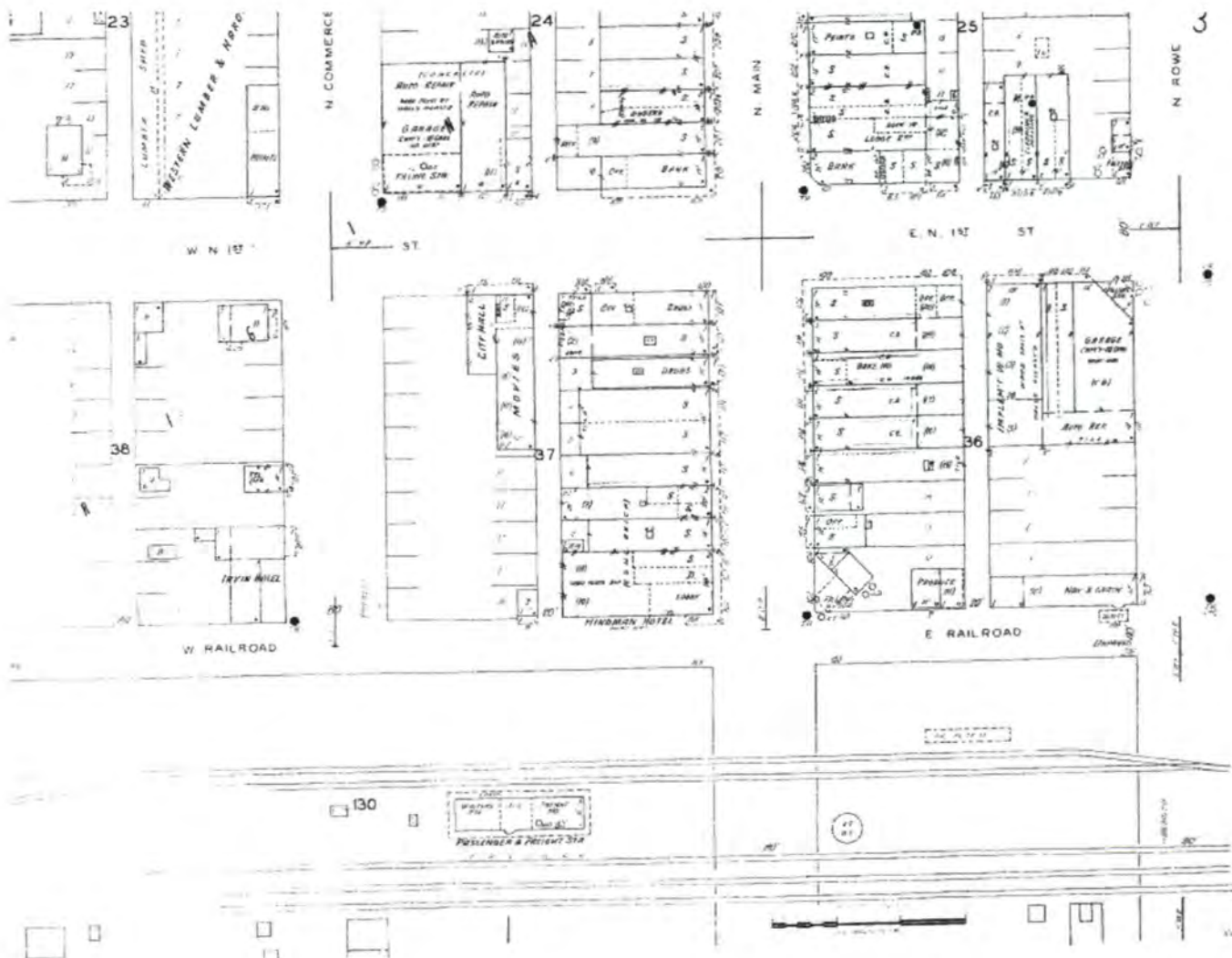
Figure 1: The McLean Sanborn Insurance Map of 1932 shows a solid row of brick buildings along Main Street between First and Railroad Streets. The gas station and garages at 119 W. First Street and 120 E. First Street are already in operation. The gas station at the northwest corner of Main and Rowe Streets was replaced ca. 1940 by Mantooth's Chevron Station. The gas station at the northeast corner of Main and Railroad Streets is no longer extant.

McLean Commercial Historic District McLean, Gray County, Texas