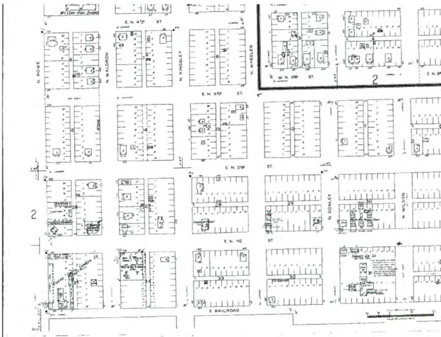
Figure 3: East of Rowe Street on E. First Street (U.S. Route 66) are two tourist courts and several gas stations which are no longer extant.

McLean Commercial Historic District McLean, Gray County, Texas