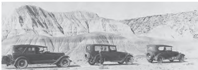
Historic Route 66 (1)