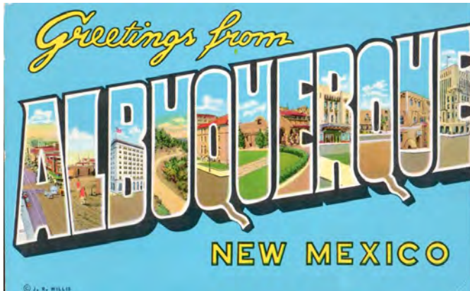
Post Card (1)