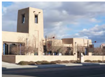
Bell Trading Post Lofts, now (1)