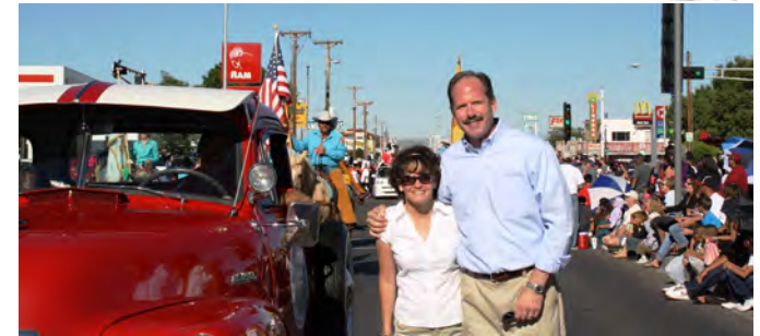
Mayor Berry, Parade (3)

In order to facilitate and coordinate public investment along Route 66, projects and actions are grouped into two areas: those which will be implemented corridor-wide and special projects specific to each activity node. This strategy recognizes the need for consistency and inter-department coordination for large-scale projects that affect the entire corridor, as well as the unique conditions and needs of projects within individual neighborhoods and districts. Where possible, projects have been identified for existing public property to maximize City resources. In addition, this strategy recognizes the need for implementation flexibility to allow for actions and projects to be implemented as funds and opportunities become available. An Action Plan Matrix has been developed as part of this Plan and lists priority projects and funding sources. The Action Plan is intended to be a "living" document that is reviewed and updated by relevant City departments on an annual basis.