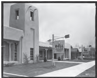
Bell Trading Post, then (1)