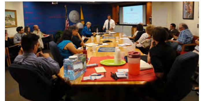
Working group meeting (3)