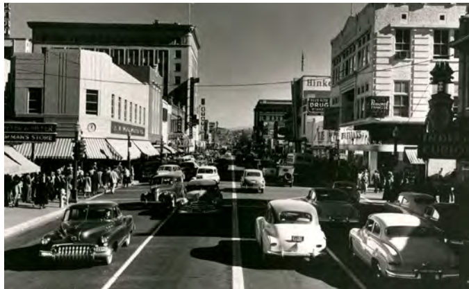
Historic Route 66 / Central Avenue (2)