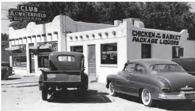
Albuquerque Route 66 Businesses (2)