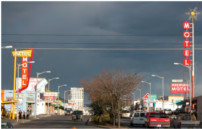
Aztec and Premier motel signs (1)