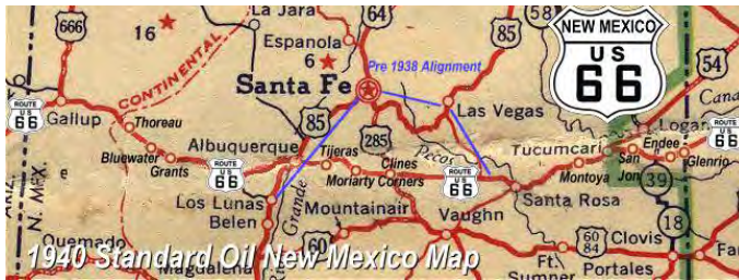
1940 Standard Oil Map