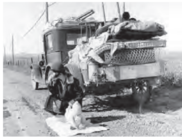
Franklin D. Roosevelt Presidential Library