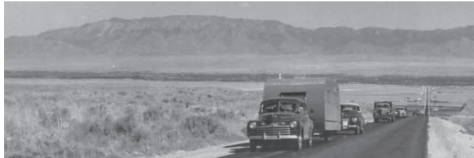
Historic Route 66 (1)