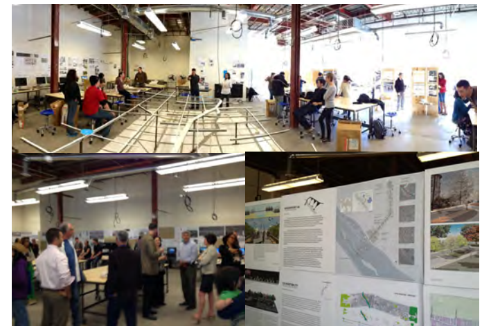
City Lab (4)